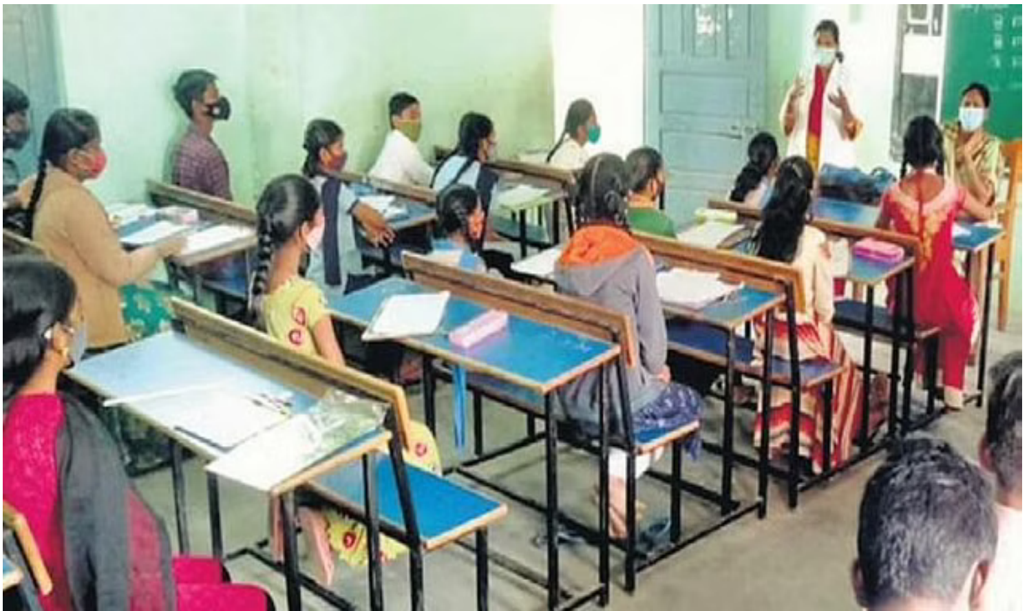
Experts conduct an awareness programme at a school in Kompally, Medchal-Malkajgiri district